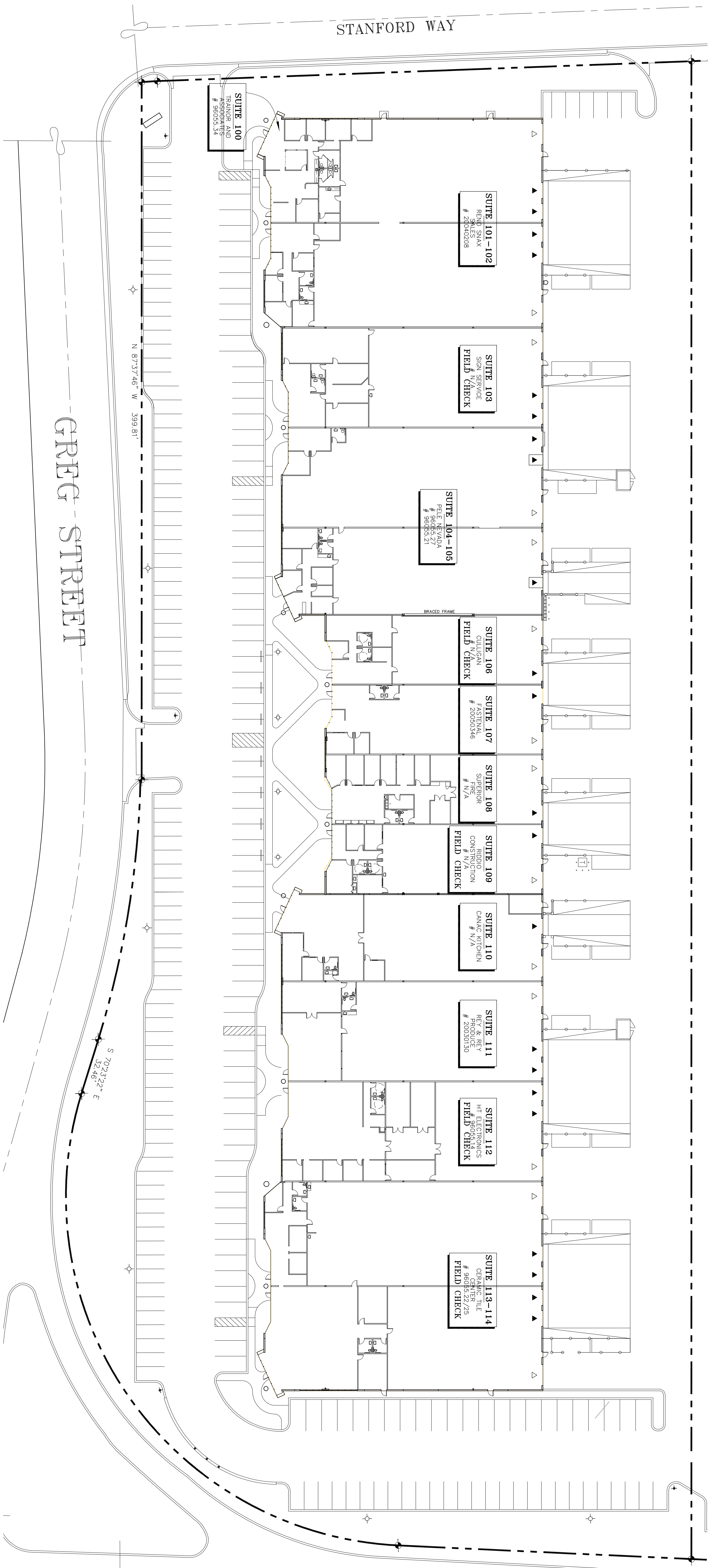
GREG CENTER BUILDING A FLOOR PLAN